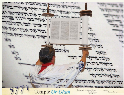
5771 Temple Or Olam

Enjoy finding fellow congregants beaming at you from its pages!